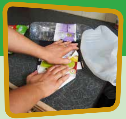
Flatten your cardboard and plastic bottles.