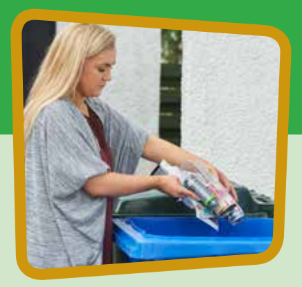
Place all of your materials loosely into your blue recycling bin – no bags please.