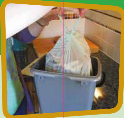
When the liner is full, tie and remove from caddy and replace with a new liner.