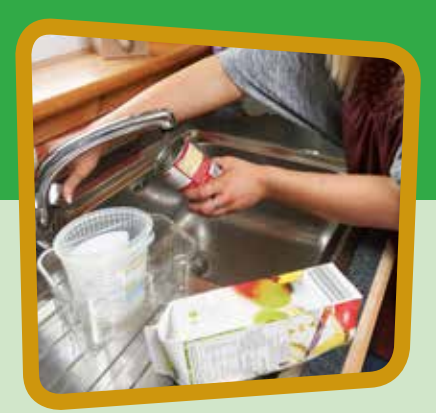
Wash and squash your cans, tins, cartons and plastic containers. Don't forget to remove the lids.