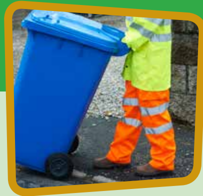
Place your blue bin at the kerbside on your collection day by 7am.