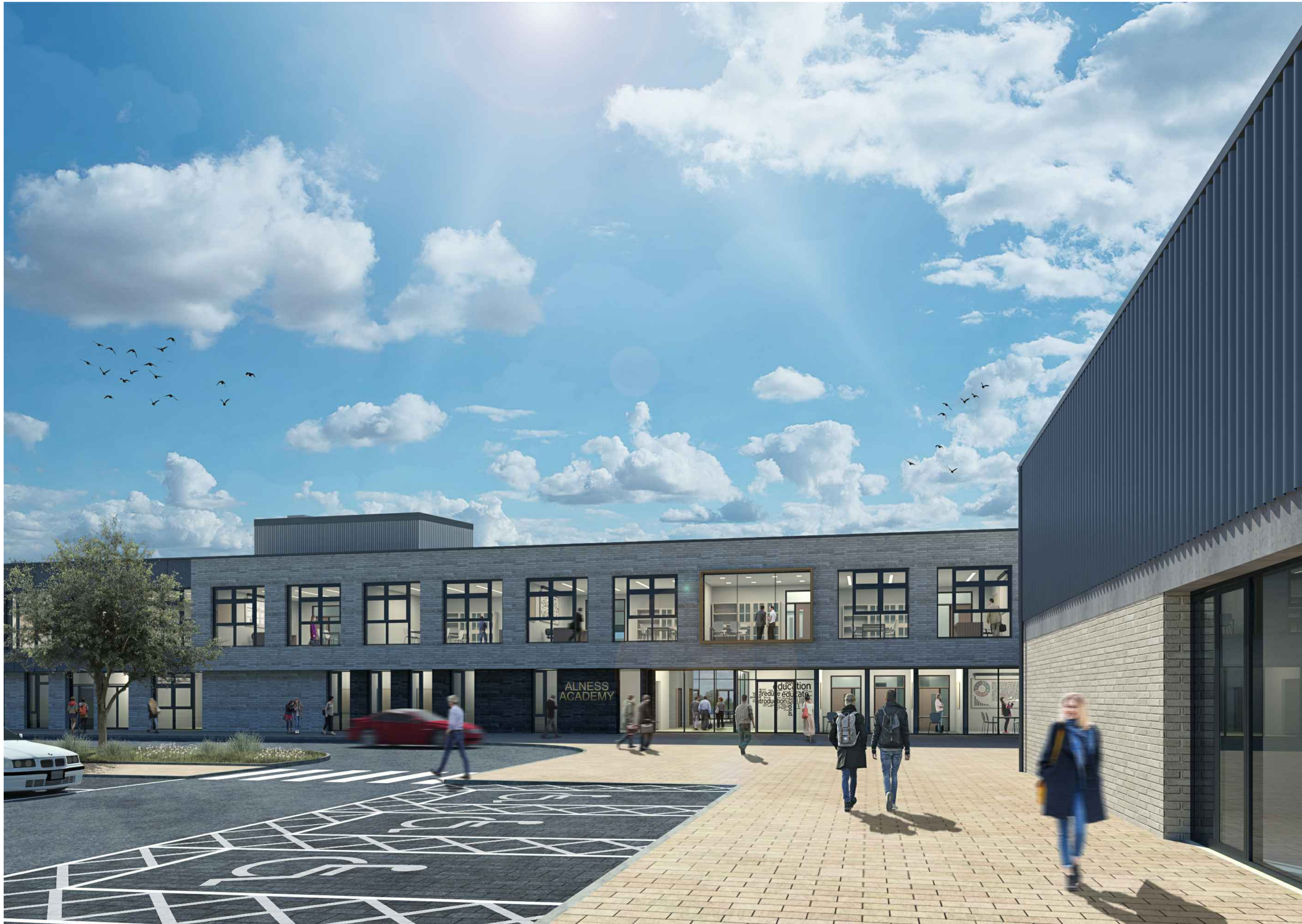
VIEW FROM NORTH WEST, LOOKING FROM OUTSIDE THE SWIMMING POOL ACROSS TO THE MAIN ENTRANCE

NOTES: 1. THIS DRAWING NOT TO BE SCALED. FIGURED DIMENSIONS ONLY TO BE TAKEN. 2. SHOULD ANY DISCREPANCIES BE FOUND WITH THIS DRAWING, PLEASE INFORM THIS OFFICE. 3. COPYRIGHT OF THIS DRAWING IS OWNED BY JM ARCHITECTS.