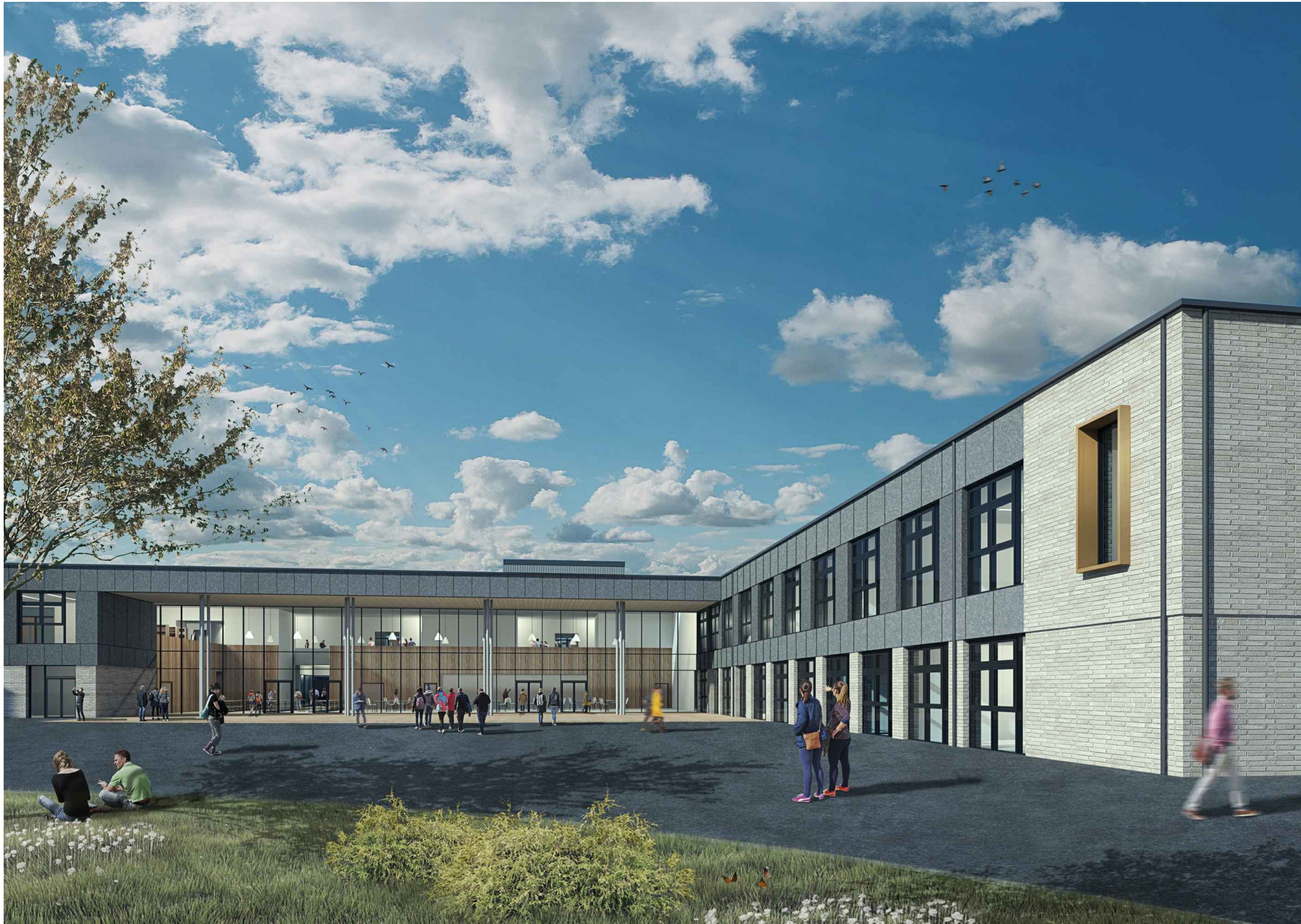
VIEW FROM SOUTH EAST, ACROSS PLAYGROUND TOWARDS DINING AREA

NOTES: 1. THIS DRAWING NOT TO BE SCALED. FIGURED DIMENSIONS ONLY TO BE TAKEN. 2. SHOULD ANY DISCREPANCIES BE FOUND WITH THIS DRAWING, PLEASE INFORM THIS OFFICE. 3. COPYRIGHT OF THIS DRAWING IS OWNED BY JM ARCHITECTS. STRUCTURAL INFORMATION INDICATIVE ONLY. TO BE CONFIRMED BY STRUCTURAL ENGINEER. REFER TO STRUCTURAL ENGINEER'S DRAWINGS FOR LOCATIONS OF BRACING & WINDPOSTS.