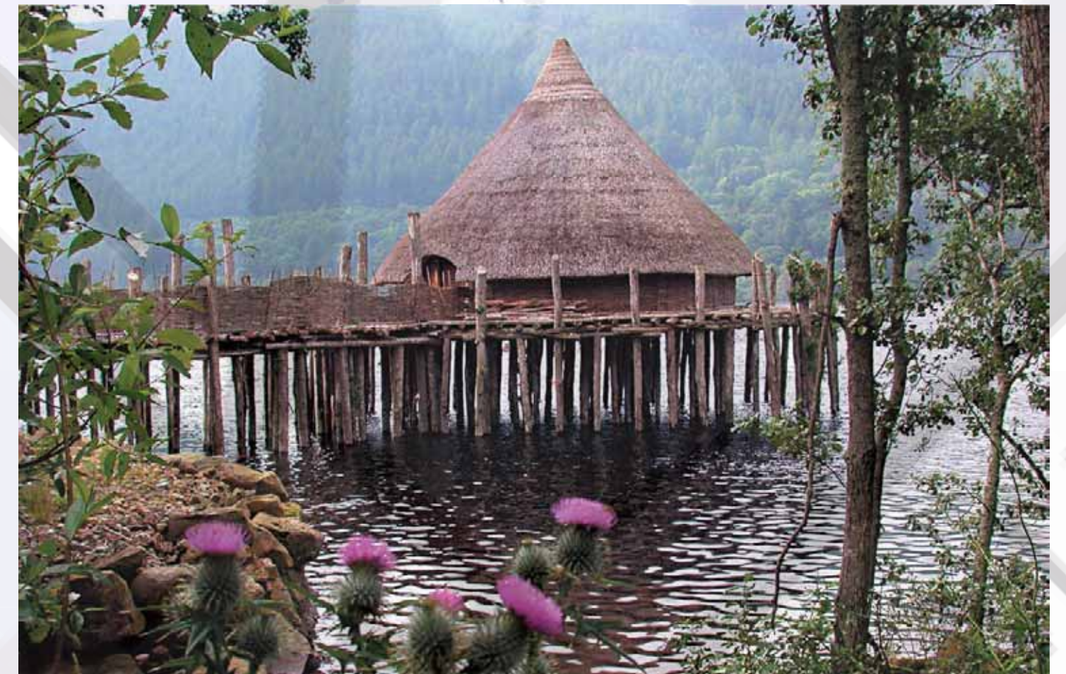
Reconstruction of crannog at the Scottish Crannog Centre, Loch Tay.

The forest has a huge network of tracks on which to cycle and walk and you are welcome to explore. Some of these tracks link with the glens to the north and west and continue to Glen Affric and beyond. All of the tracks offer outstanding views over Loch Ness. Other circular tracks near Fort Augustus allow you to explore the River Oich and Torr Dhuin, site of an ancient hill fort.