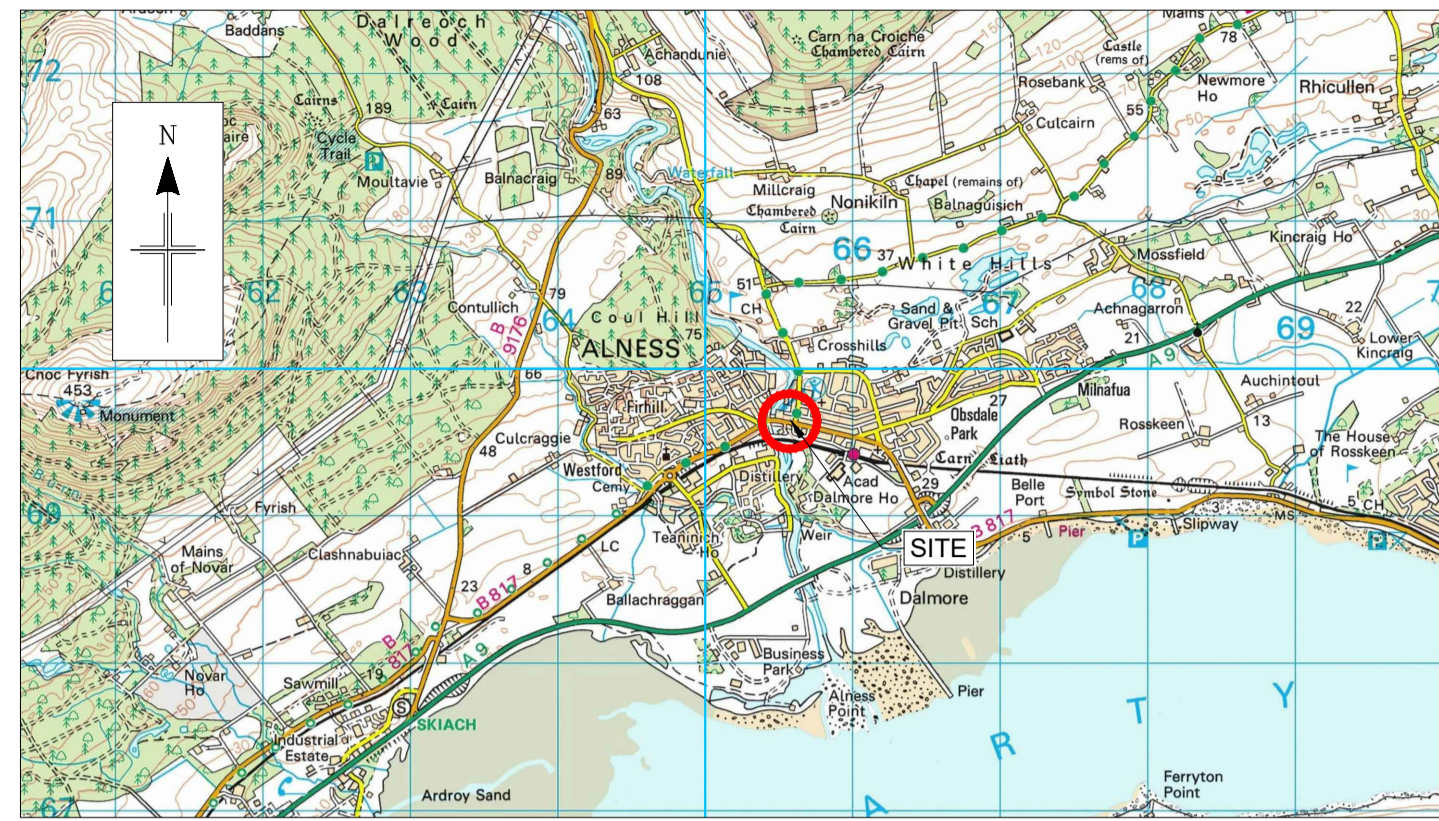
LOCATION PLAN SCALE 1:50,000