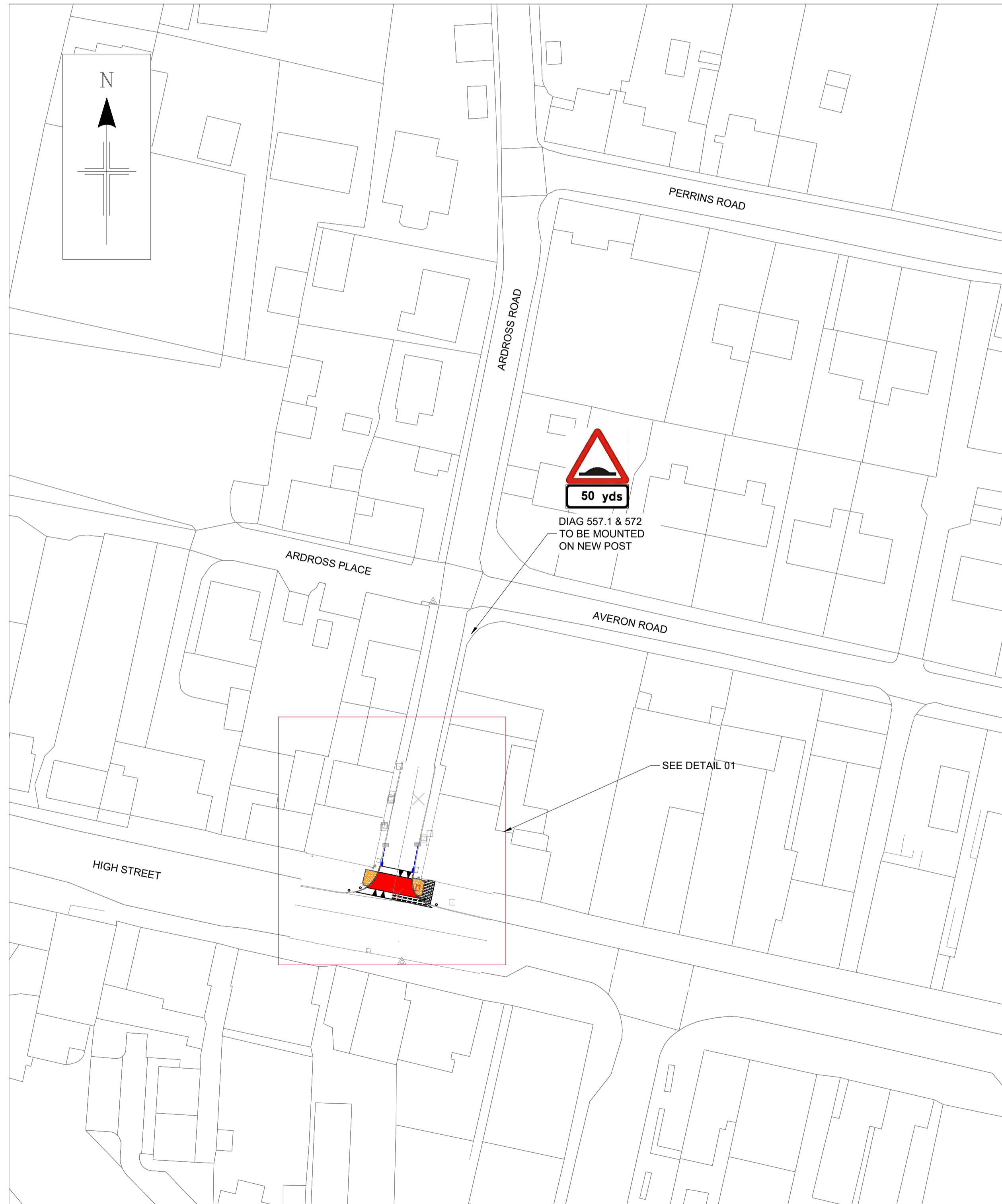
GENERAL LAYOUT SCALE 1:500