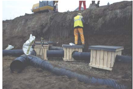
Above: plan of a medium size Type 1 Design artificial sett. Right: Type 1 Design artificial sett under construction, A97, Aberchirder, Scotland (Grampian Badger Surveys for Aberdeenshire Council 2000).