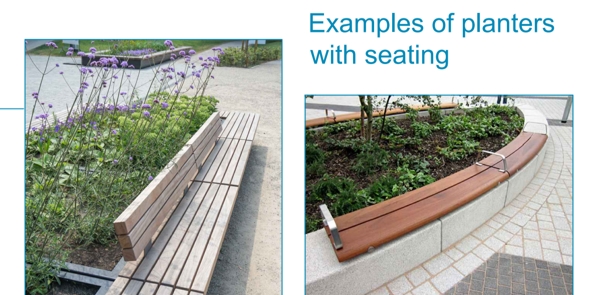
Examples of planters with seating