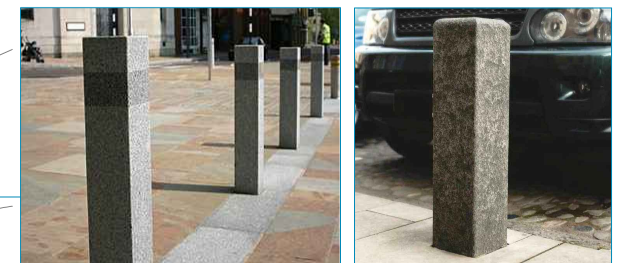
Examples stone bollards. Bespoke motifs or artwork can be added as required to reflect local heritage.