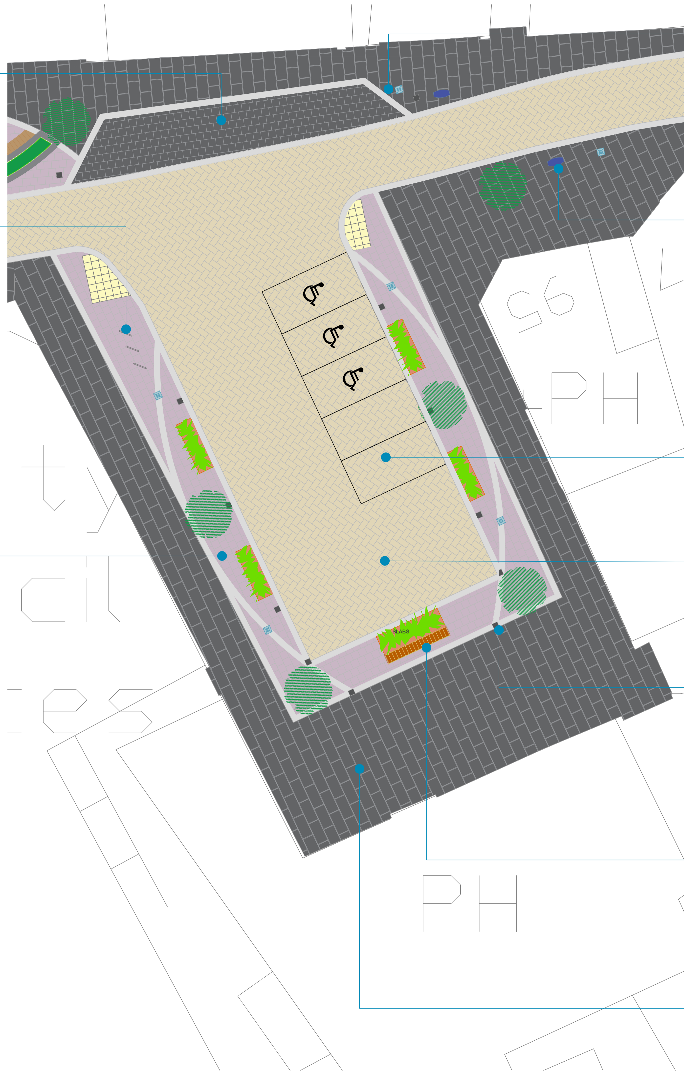
The existing Victorian lamp standards are retained in this area.