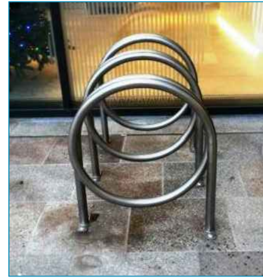
Examples of cycle stands.