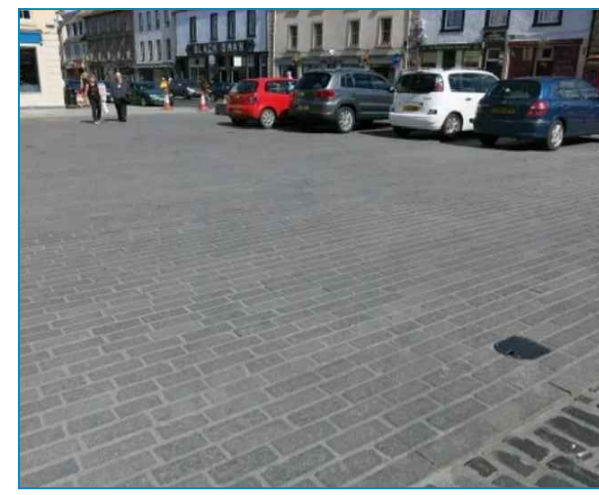
Loading Bay & Recess Area for Event Stages surfaced with whin sets