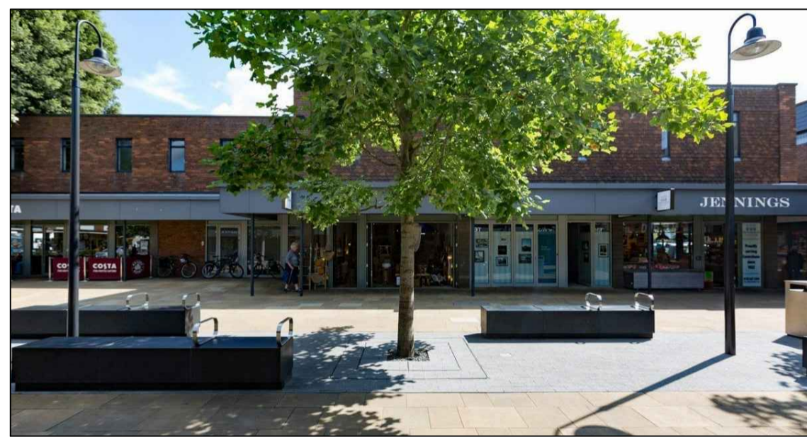
The contrasting paving design segregates the pedestrian areas from the shared surface areas. Multi-toned porphyry paving defines the areas where street furniture such as benches, cycle stands, bollards, planters and trees are located.