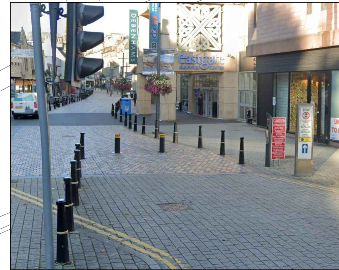
Ref. 7: Automatic rising bollards example used in Inverness High Street.