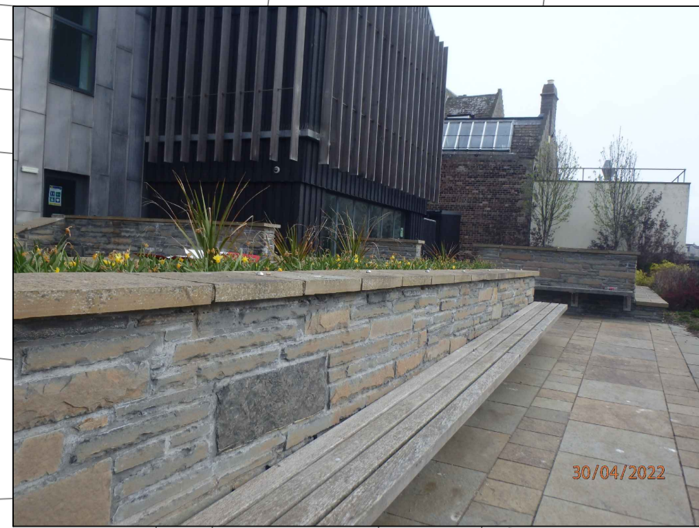
Ref. 3: Caithness flagstone planters with built-in bench seating