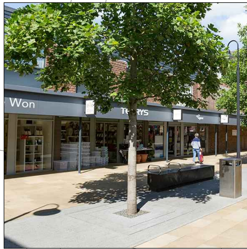
Ref. 2: Contrasting paving design example integrating street furniture, such as benches, trees, bicycle stands etc., into new shared public space