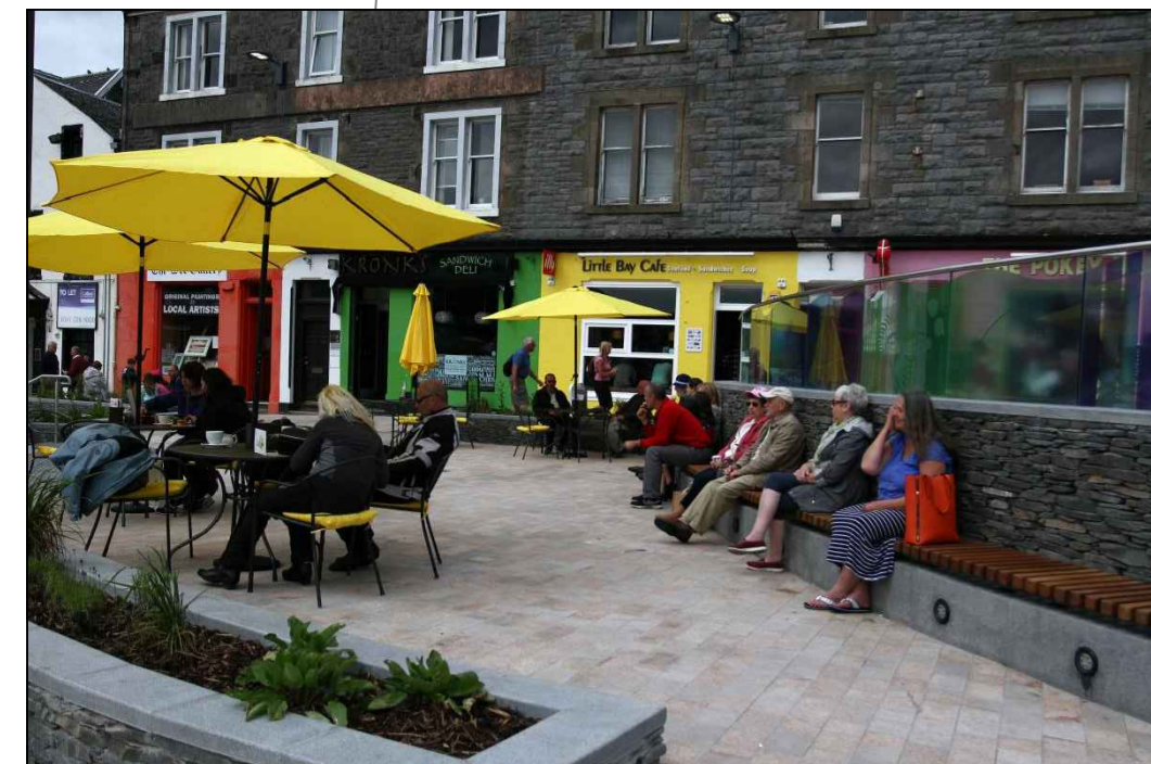
Ref. 4: Examples of planters with built-in seating