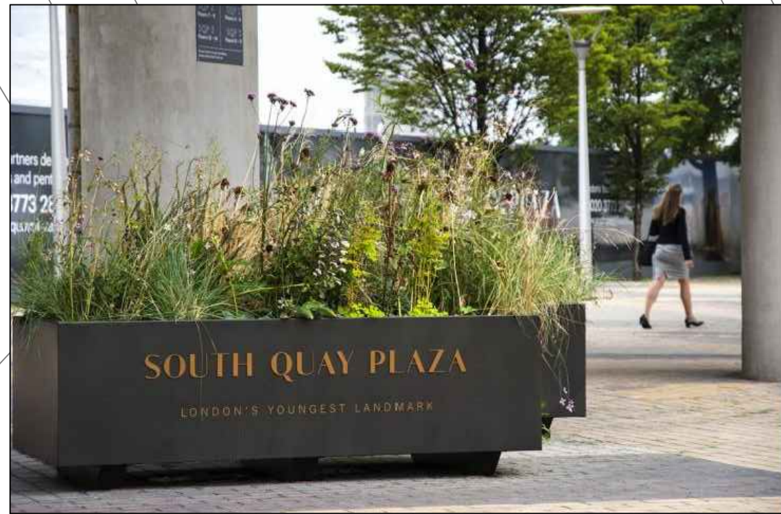
Ref. 5: Examples of planters inscribed with text