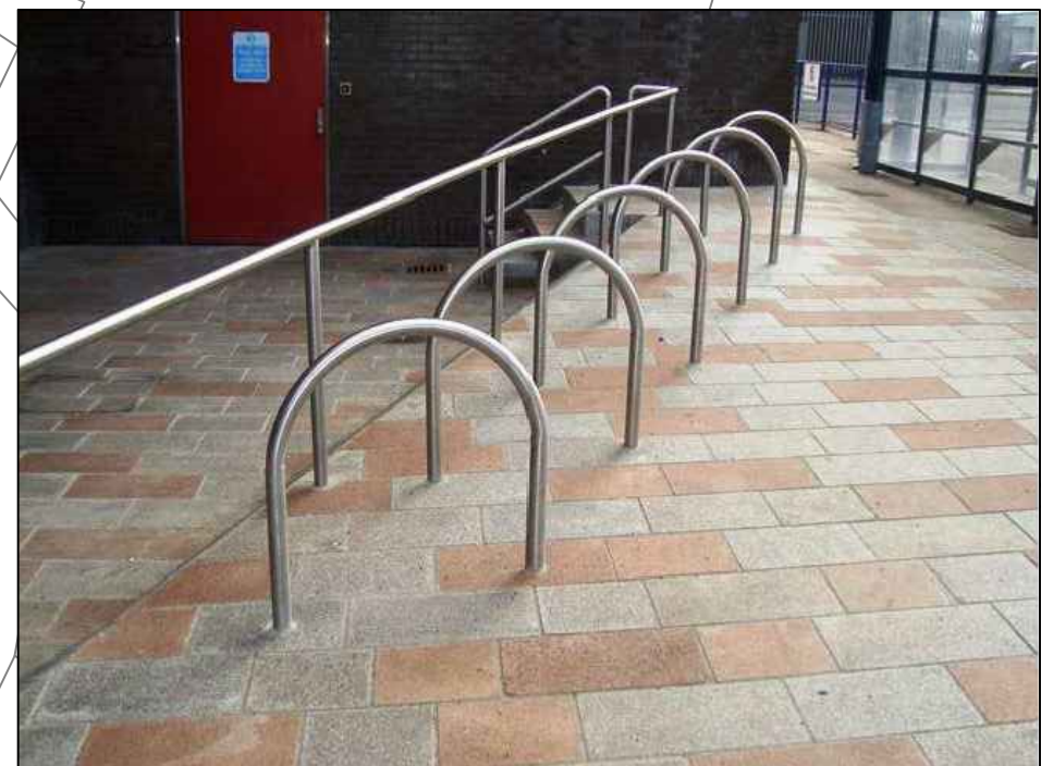
Ref. 1: Examples of bicycle stands

© Crown copyright and database rights 2021 OS 100023369. You are granted a non-exclusive, royalty free, revocable licence solely to view the Licensed Data for non-commercial purposes for the period during which The Highland Council makes it available. You are not permitted to copy, sub-license, distribute, sell or otherwise make available the Licensed Data to third parties in any form. Third party rights to enforce the terms of this licence shall be reserved to OS.