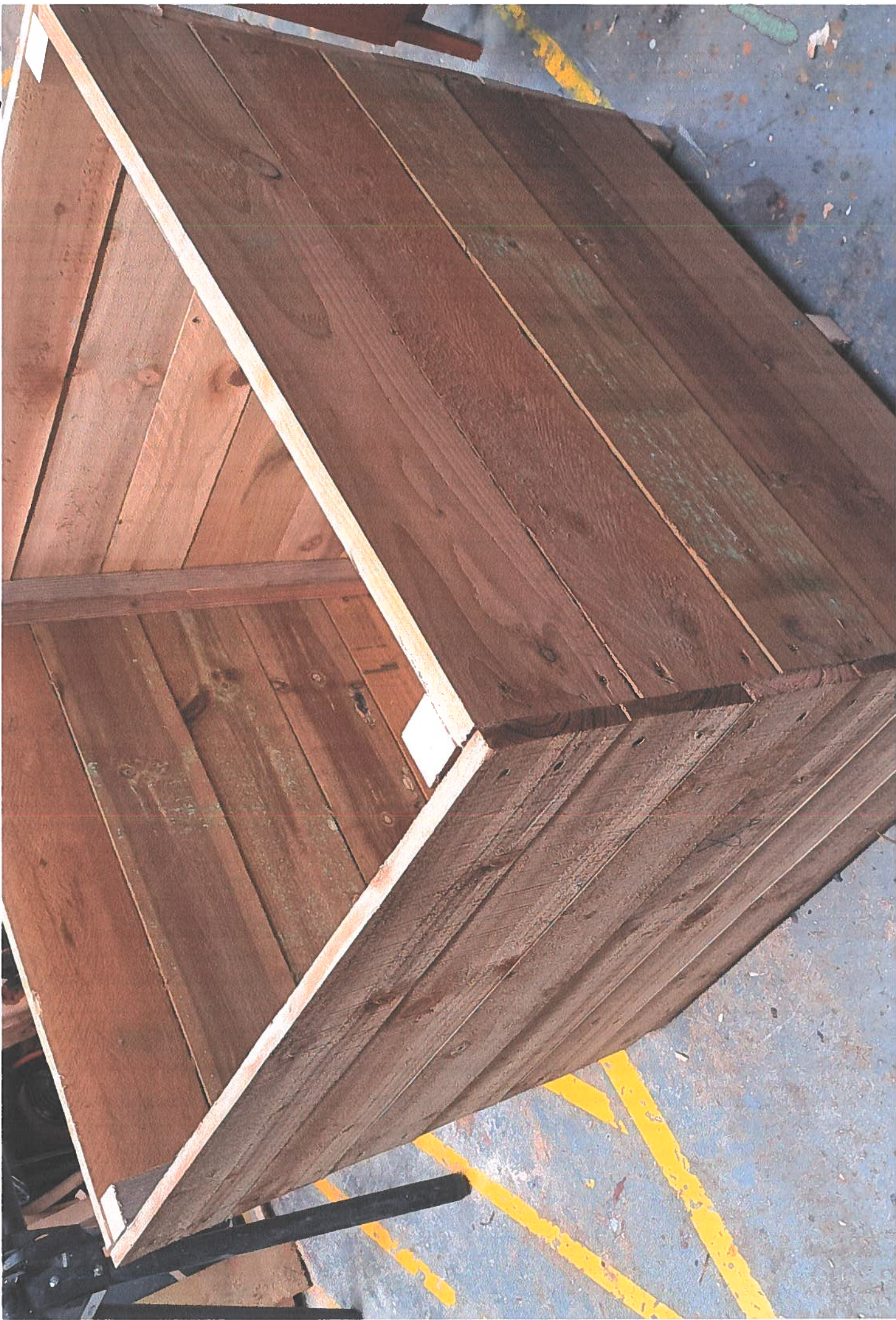
Completed planter for College - part of which Robbie helped with (community involvement)