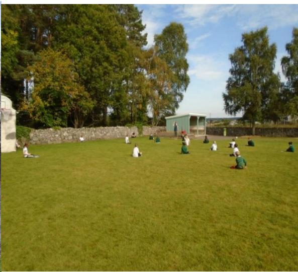
We have a wonderful outdoor space.