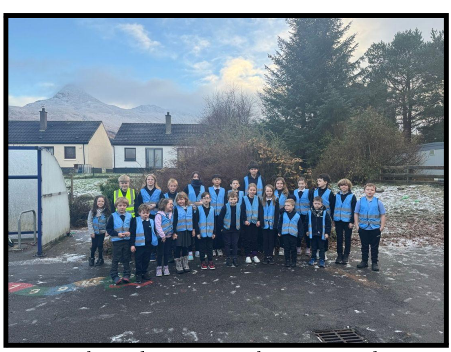
Work Together, Learn Together, Grow Together