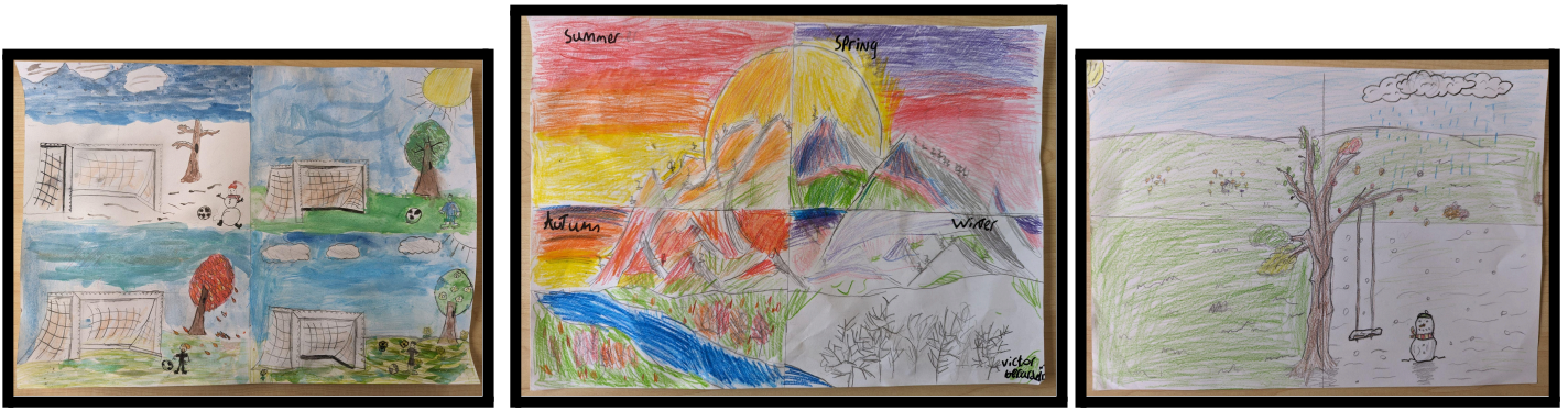
Artwork created by our P6/7 class for a competition in November 2023