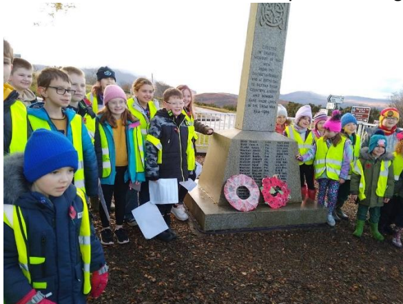
Tongue Primary and ELC visiting the war memorial.