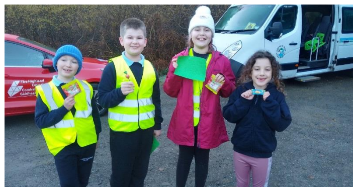
Four of our P4-7 pupils won joint first place in a wildlife challenge during a campus event in November '23.

Parents/carers may be asked to contribute toward a school trip, to a maximum specified amount. Vehicles with seatbelts are used for school trips and all pupils and staff must wear them.