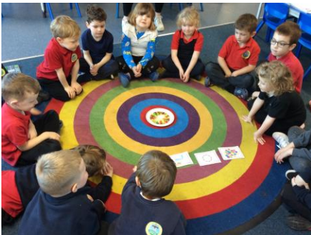
P1/2 looking carefully during a science experiment

P5/6 is the best class ever because its quiet to work in. My favourite thing to learn is maths, I like division sums - Oktawia P5/6