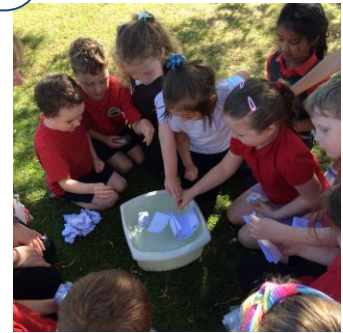
P2/3 waterproof experiment