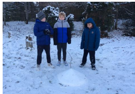
P6/7 liked how smooth they made their Andy Goldsworthy snow sculpture