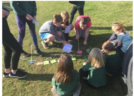
Kindness Understanding Honesty Determination Teamwork

A block of 11 weeks swimming tuition is offered to Primary 4 and Primary 5. This takes place at Nairn swimming pool under the instruction of the pool staff. The tuition is provided by Highland Council with the school incurring the transport costs. As a result, parents are asked to contribute £2.00 per session paid to the teacher on the day.