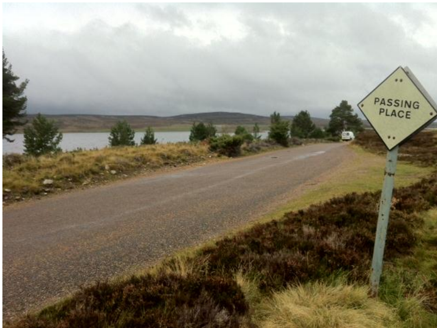
The same area in October 2013