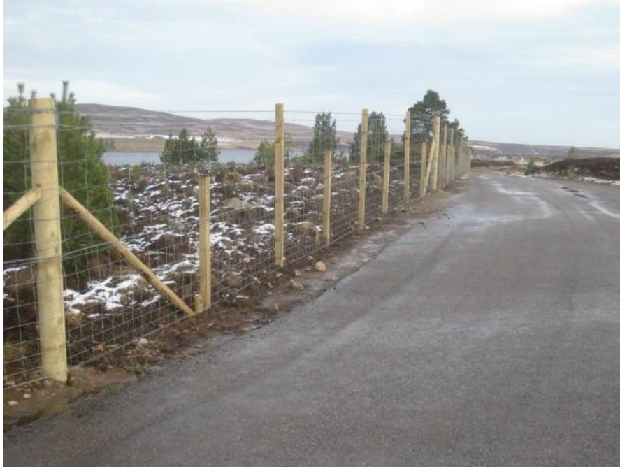
Fencing in February 2012