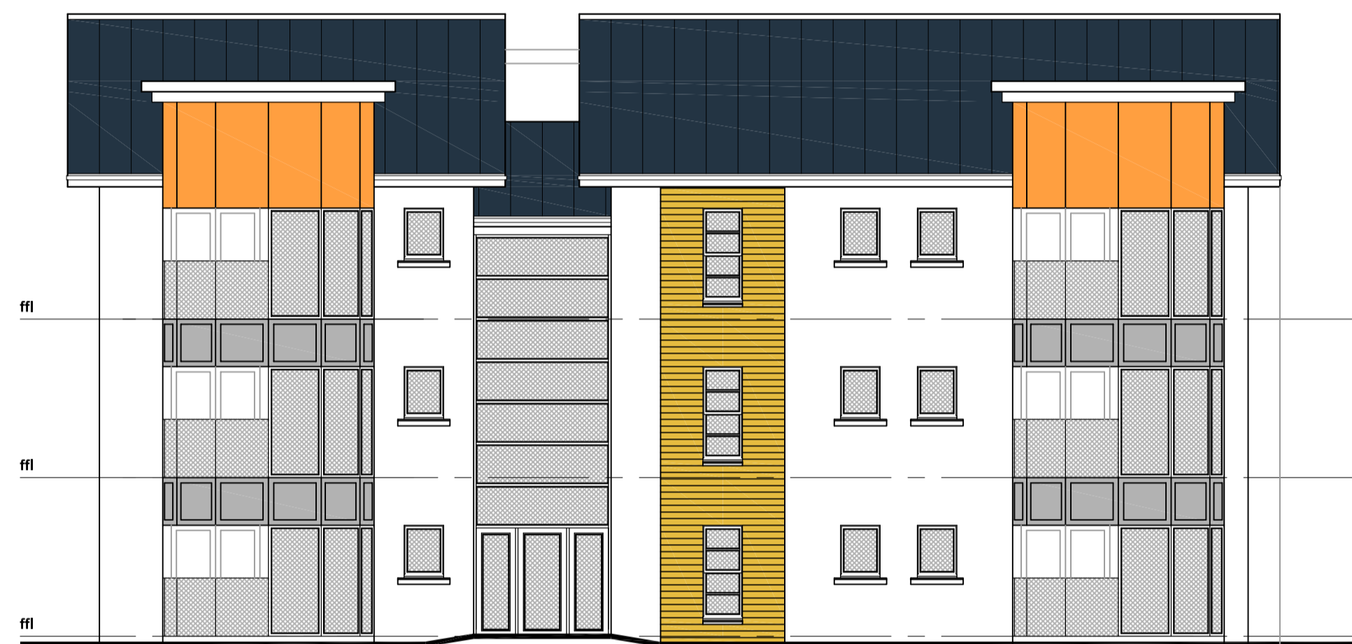
Front Elevation 1:100