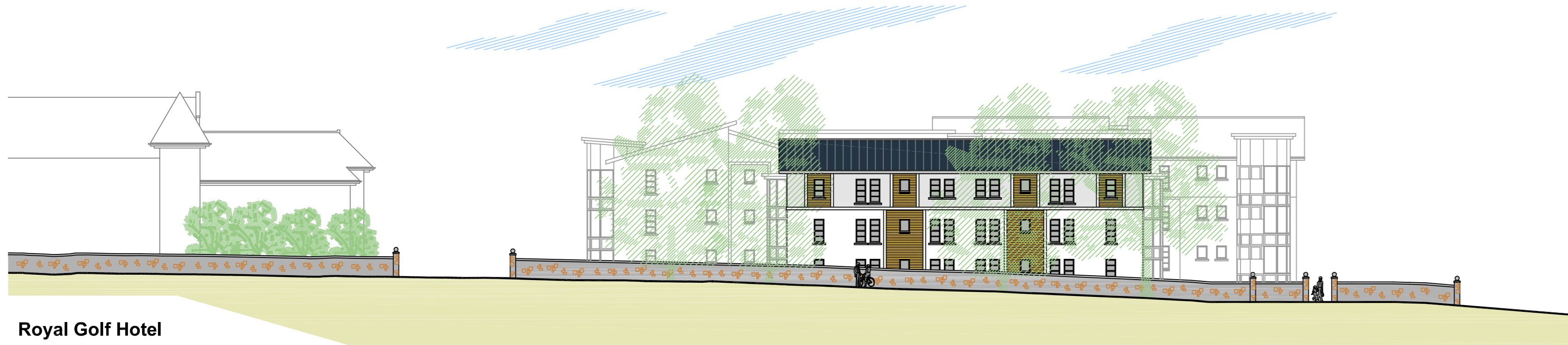
Royal Golf Hotel