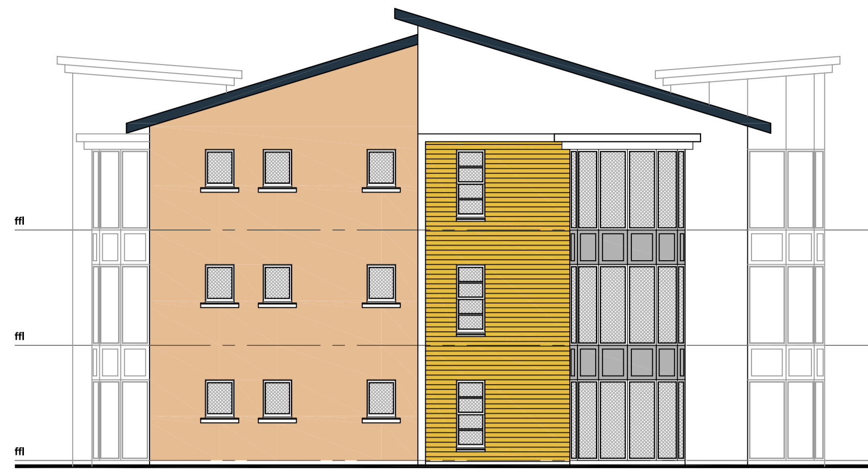
Side Elevation 1:100