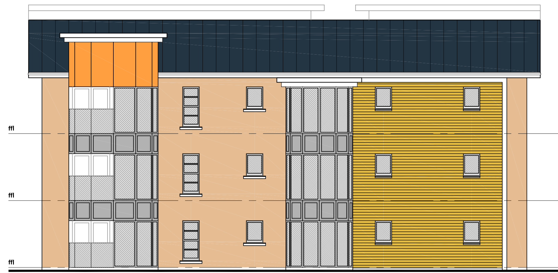
Rear Elevation 1:100