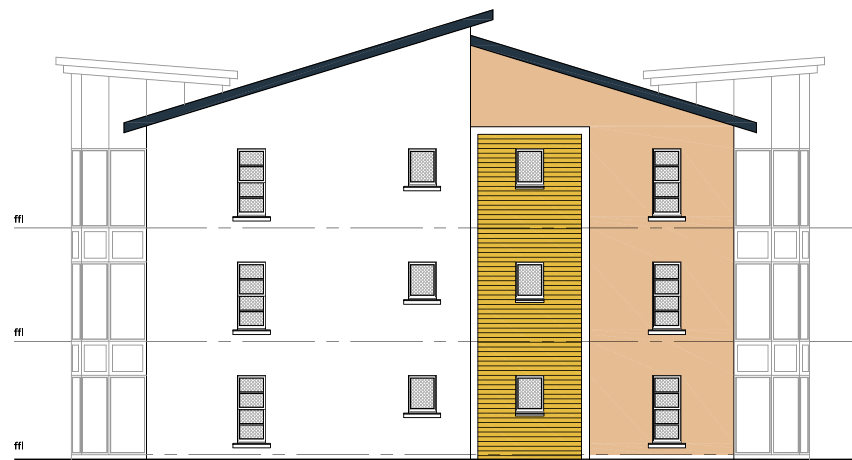
Side Elevation 1:100