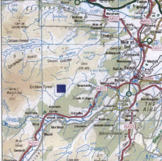
General Location Plan, scale 1:250,000

PLANNING & DEVELOPMENT SERVICE DATE RECEIVED: 17 FEB 2014