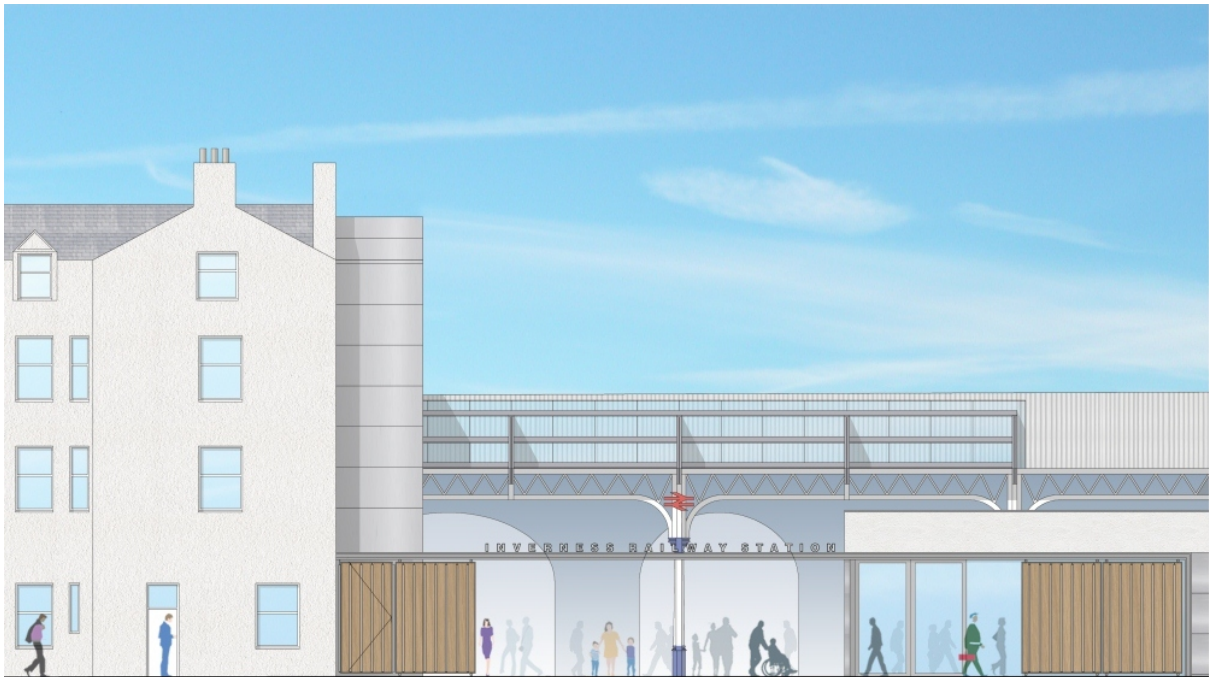
Station entrance viewed from Falcon Square