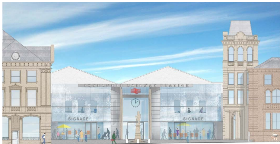
2 - Overcladding of Existing Building