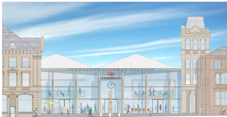
3 - Masonry columns