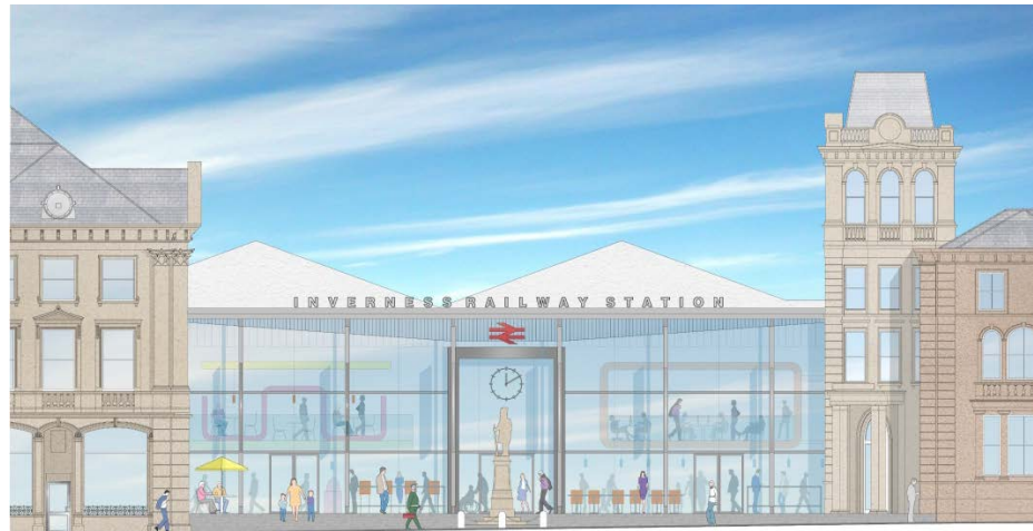
1 - Steel columns