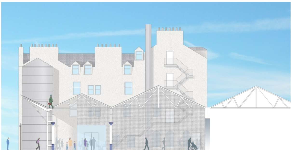
Cross section through station entrance