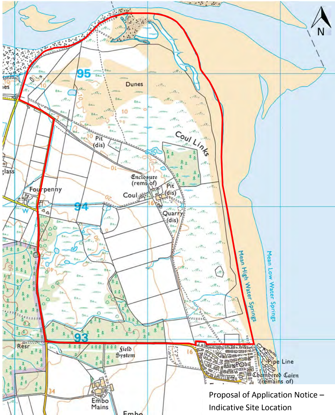
Proposal of Application Notice – Indicative Site Location