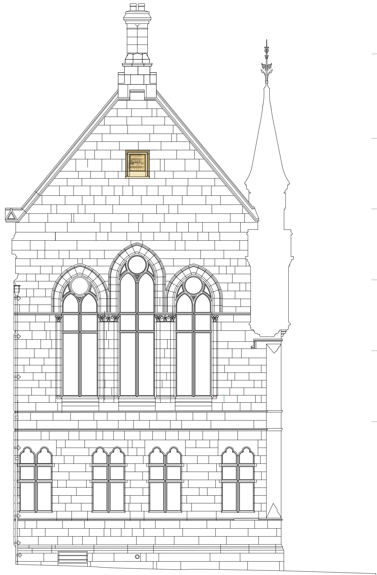
EAST ELEVATION PHASE TWO 1:100

Scale: Date: Drawn: Reviewed: As noted OCT' 16 GM IF @ A3 Revisions: