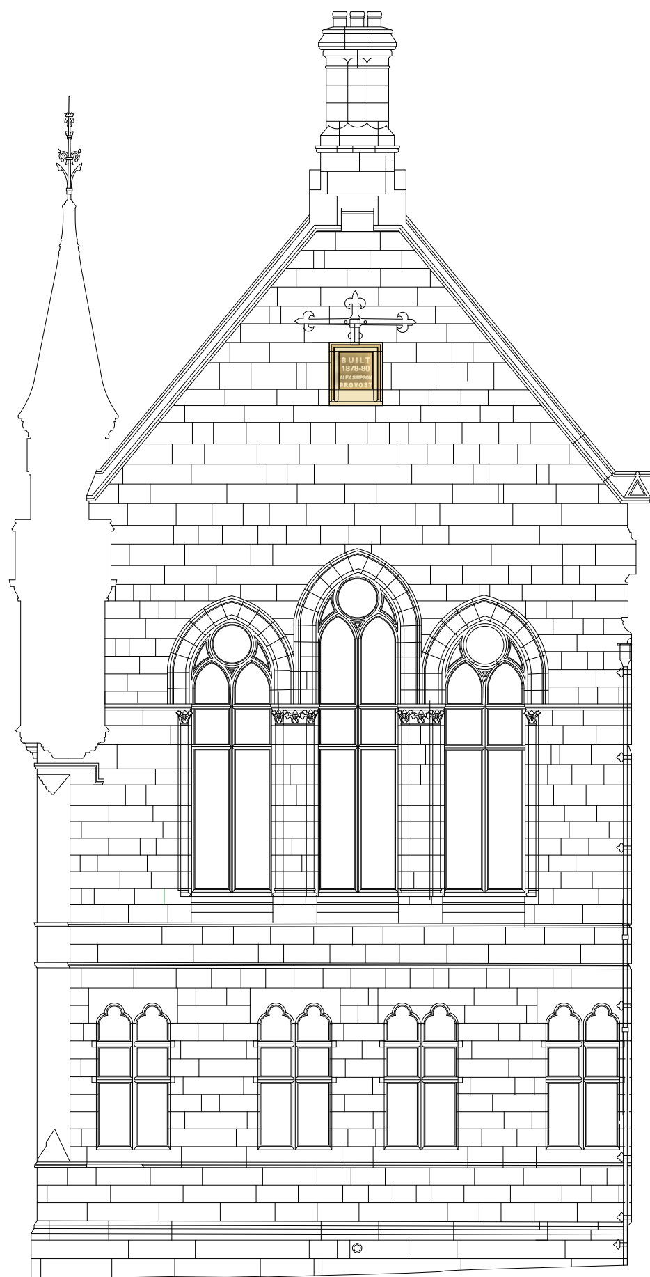
NORTH EAST ELEVATION PHASE ONE 1:100

Scale: Date: Drawn: Reviewed: As noted @ A3 OCT' 16 GM IF Revisions: