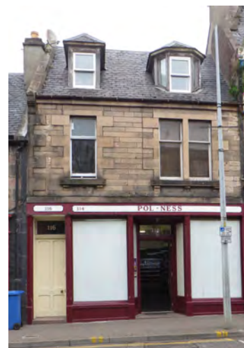
AFTER: Fascia and door reinstated with a traditional finish (Academy Street, Inverness)