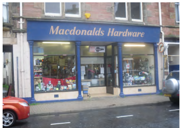
... but it is likely that the original fascia survives below the modern alterations and the character can be restored relatively simply