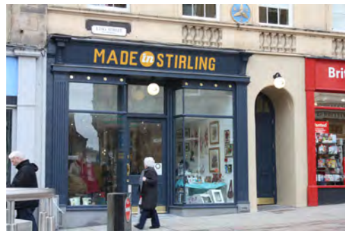
AFTER: Shopfront, with traditional proportions and detailing, reinstated (King Street, Stirling)