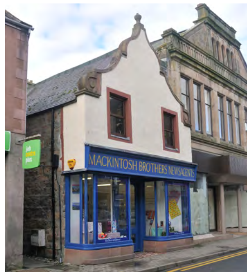
AFTER: Traditional shopfront, with stallriser and painted signage, reinstated (High Street, Dingwall)