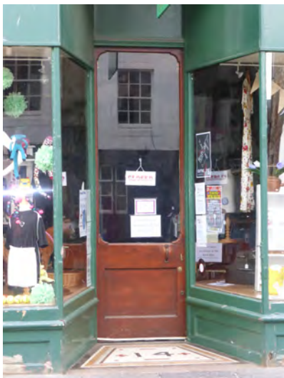
Doors are an important part of any shopfront and can be outstanding features in their own right