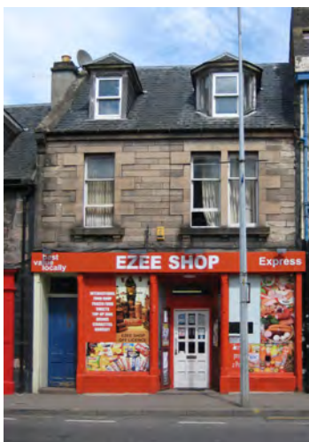
BEFORE: Poorly considered alterations obscure this traditional shopfront's character