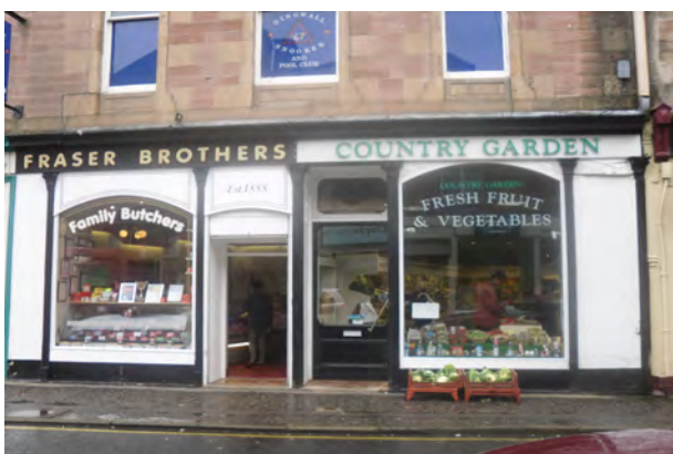
A pair of contemporary shops with cast iron pillars finished in complimentary colours.

A range of alternative materials may be acceptable for non-traditional shopfronts provided they are part of a well-designed scheme that uses high quality materials and is appropriate to the context. It should be noted that uPVC is never acceptable in a listed building or conservation area. Elsewhere its use is discouraged and should be carefully considered.