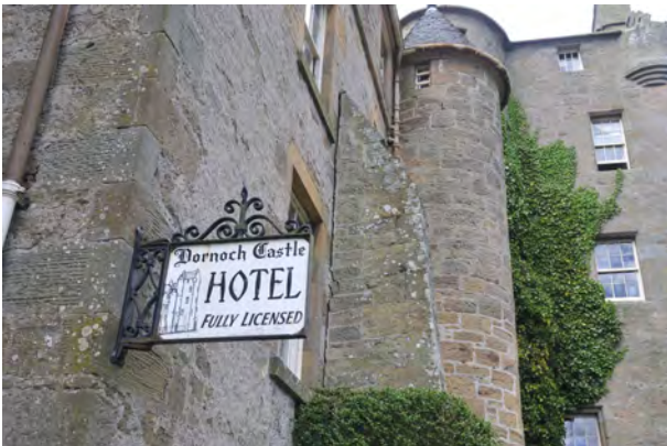
Ornate cast iron bracket with a mixture of gothic text and image reflects the business