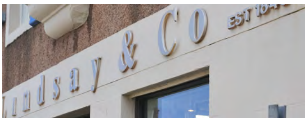
Individually applied lettering scaled to the depth of the fascia can be an effective way of adding signage to a shopfront.