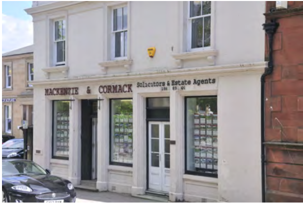
Individually applied lettering