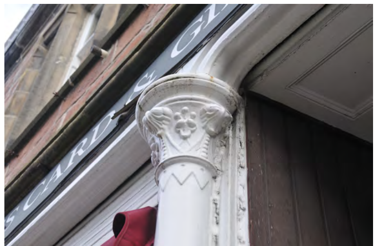
Columns fulfill a similar role to pilasters often framing the display and entrance