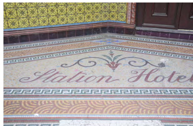
Decorative thresholds are important survivals and increasingly rare. They must always be retained, even when they display the name of a previous business