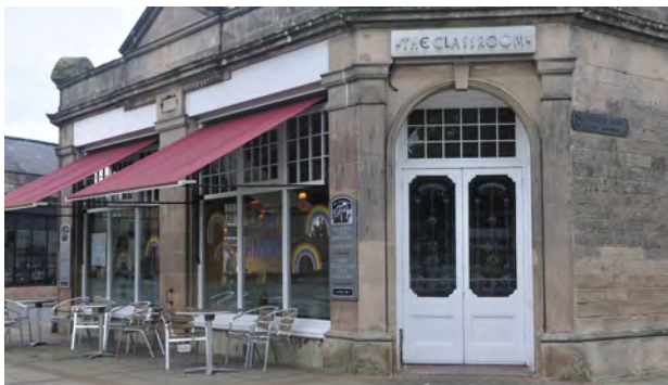
The blinds provide shelter for external tables and are retracted into unobtrusive purpose-built blind boxes under the fascia.