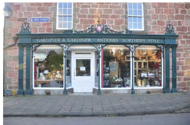
Ornate pilastered Edwardian shop with delicate cast iron arcade and cresting