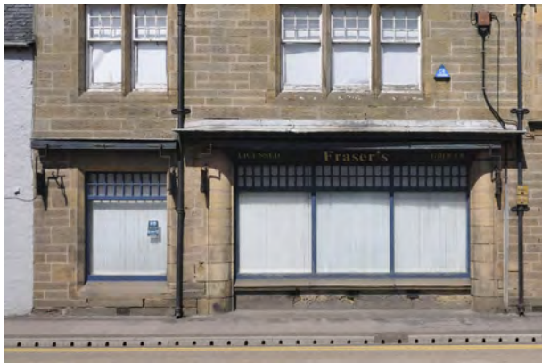
Surviving traditional canopies and awning are an increasingly rare and important survival. They should always be retained and repaired where necessary.

Dutch blinds and similar non-retractable blinds are primarily used for advertising and are not a traditional feature of Highland streetscapes. Such styles will not be supported.