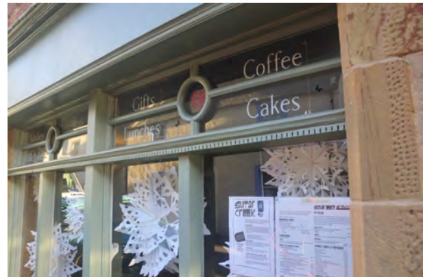
Some windows can be fairly ornate and incorporate attractive detailing