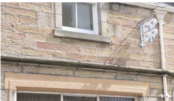
A more modern approach to a hanging sign showing the logo and a contemporary bracket