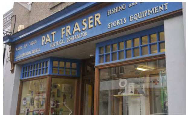
A hand painted timber fascia framed by the prominent cornice and console brackets