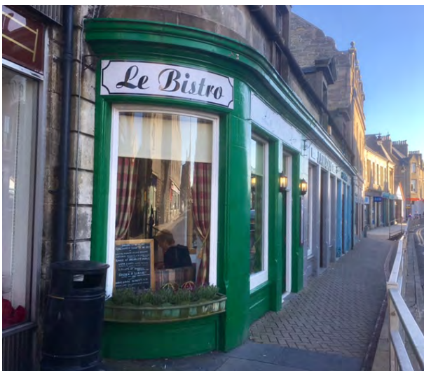
Lettering and logos should be constrained by the depth of the fascia