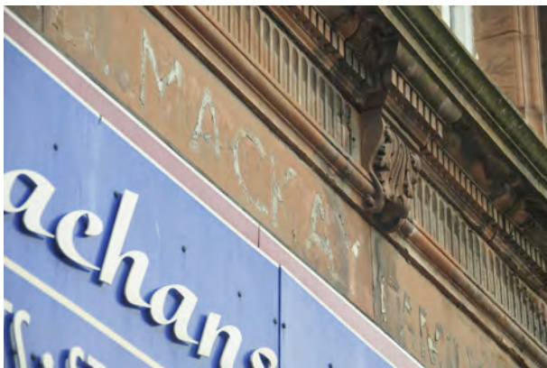
The painted lettering of a business that previously occupied this shop is still visible on the original stone fascia. Historic lettering, where it survives, is an important indicator of the building's history and should be retained. The new signage lacks the style and character of the original