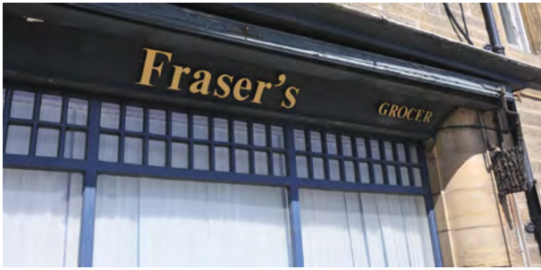
Shopfronts have a variety of different glazing patterns with mullions and transoms dividing the display area