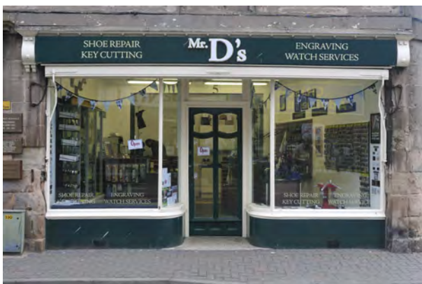
An interwar shopfront that, with the exception of curved glazing to the lobby, is remarkably intact, including the original awning

A traditional shopfront typically conforms to a basic pattern, despite having evolved and responded over time to take advantage of technological advancements in materials and design. It typically consists of a door, windows, fascia, cornice, pilasters and stallriser. These elements and components are explained in more detail in Section 5. Traditional shopfront features are subject to a wide range of variation, however, and may vary greatly from building to building.