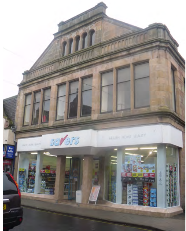
The original fascia is likely to survive underneath the existing. Otherwise, very little trace of the original shopfront survives