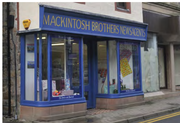
The use of a single colour can help unify a shopfront