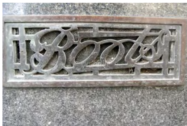
Bespoke metal ventilation grille displaying the business name