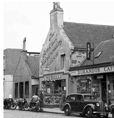
Gable sign writing is not often seen today, but may be supported on painted or harled buildings