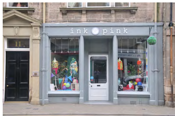
A Victorian shopfront that retains much of its original character. The finish and fascia has been well considered to give it a contemporary twist