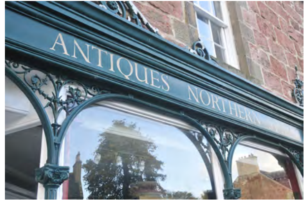
Hand painted signage on a timber fascia