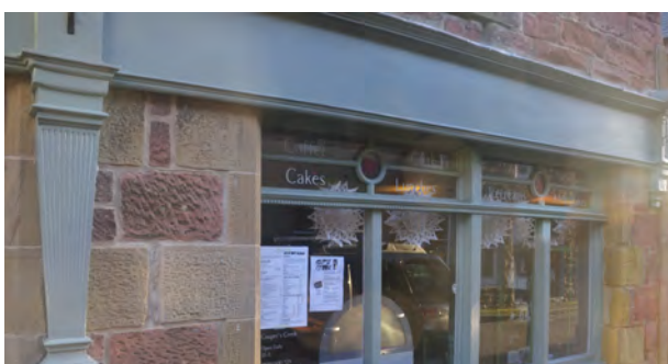
Here, exposed stonework is an integral part of the shopfront. The paint finish has been carefully chosen to compliment the colour of the stone