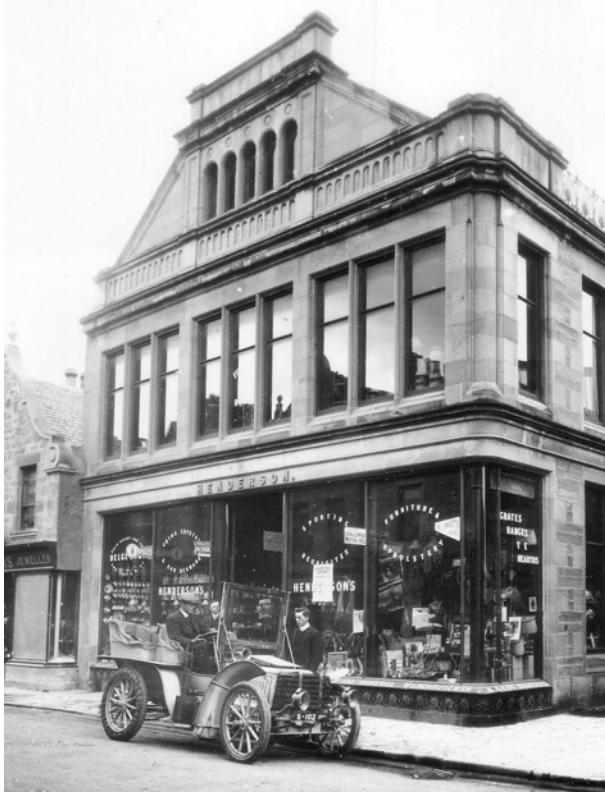
A formerly handsome traditional shopfront that has largely been removed by an unsympathetic replacement (right)

Many traditional shopfronts have undergone unsympathetic modifications that have obscured some or all of their traditional features or are otherwise poor quality. These frequently detract from the character of their surroundings. It is often possible to improve the appearance of a modified shopfront by repairing or reinstating traditional features, colours and signage.