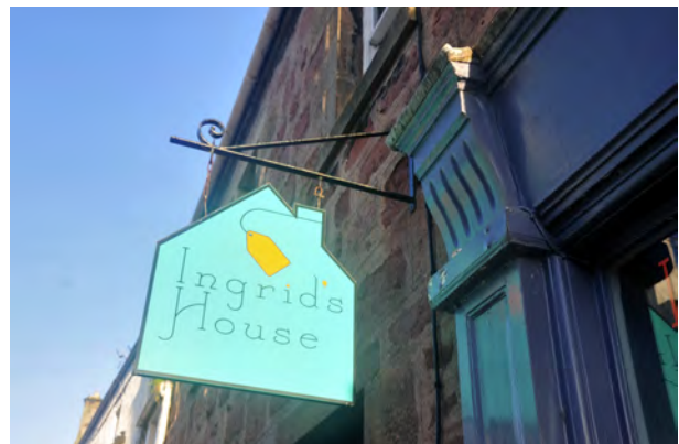
A standard bracket with the sign cut to help represent the name of the business