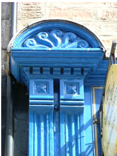
Picture 5.1 An ornate console brackets, often used to bookend the fascia