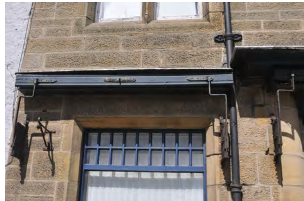
The detailing and mechanism as well as the design of traditional awnings all contribute to the significance and character of the shop