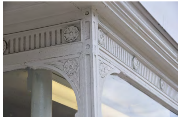
Cast iron window surround framing the display window