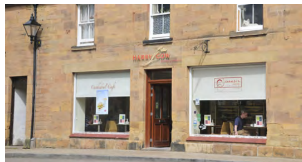
Internal blinds are an effective way of protecting goods or customers from sunlight without the need for external canopies