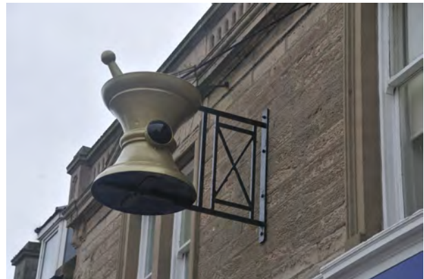
This 3D projecting sign of a pestle and mortar belongs to a pharmacy