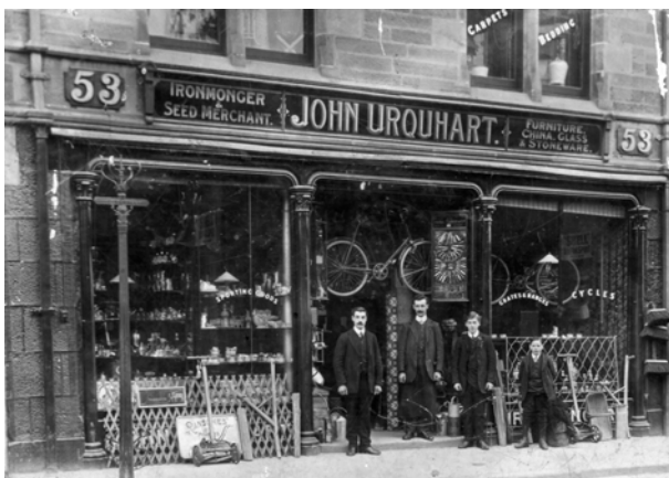
An attractive shop with cast iron pillars. Much of its detail has since been obscured (right)...