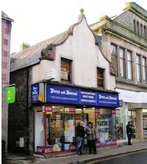
BEFORE: 1970s replacement shopfront in a traditional building

Where no evidence of the traditional shopfront exists or it can be demonstrated that reinstatement is not appropriate and/or possible, the Council will consider a contemporary design that is sympathetic to and in-keeping with the scale and character of the existing building. Design must be of a high quality. Appropriate use of traditional materials in a contemporary style will be encouraged and supported.