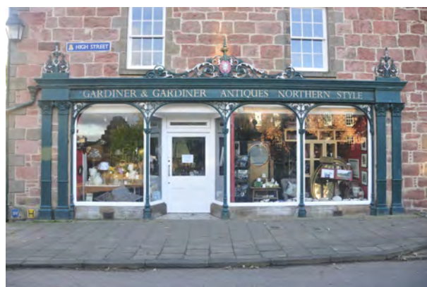
The rich green of the cast iron surround contrasts well with the white window frames and door