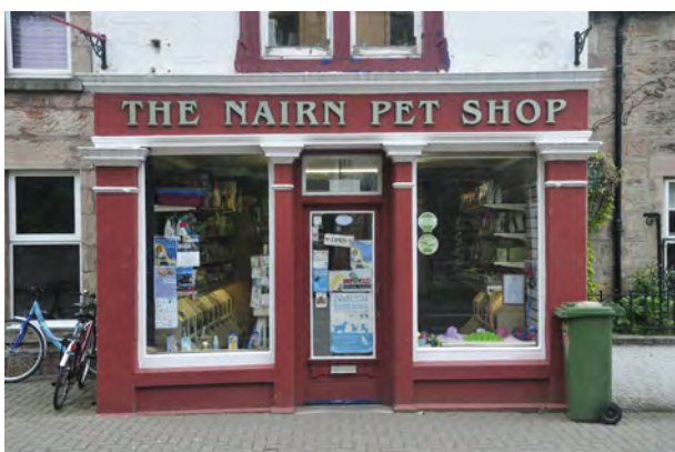
Although predominantly painted red, architectural detail has been highlighted in white