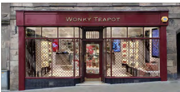
An elegant Edwardian shopfront