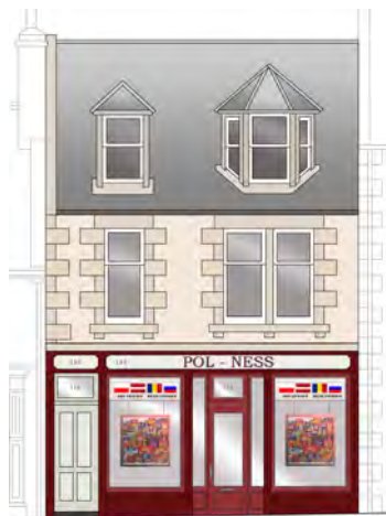
Design drawn-up to reinstate its character