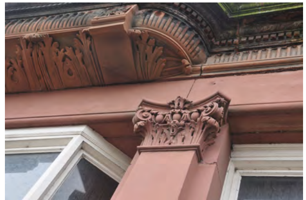
Pilasters can take a variety of forms and styles in a variety of materials. They can range from the very plain to the highly ornate