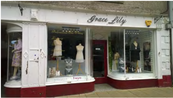
Individually applied lettering, when done sensitively, on a traditional fascia can be very effective