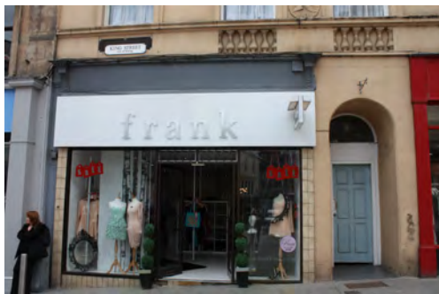
BEFORE: Unsympathetic modern replacement shopfront in a traditional building