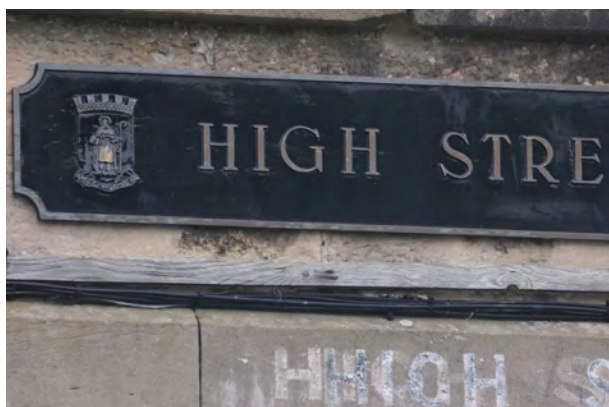
Remnants of two phases of the painted street name survive below the current metal sign

Shopfronts may contain a variety of other bespoke features not outlined above, for example, ventilation grilles, boot scrapers, door bells and old street signs. Whilst these features may be small and often overlooked, they can have a significant bearing on our understanding of the building's history and contribute to its character.