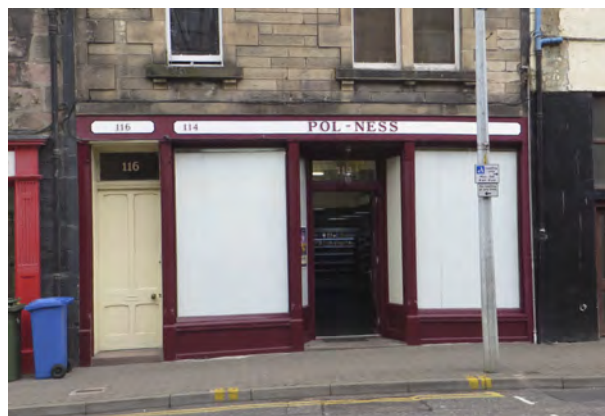
Dark muted tones can be particularly effective on traditional shopfronts