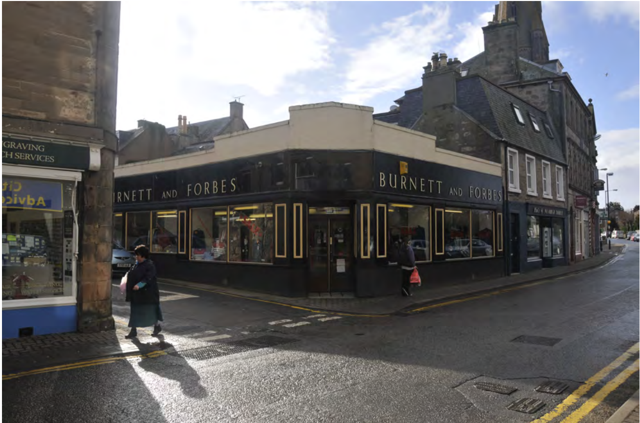
A distinctive 20th century shopfront that makes a positive contribution to the surrounding streetscape

Over the course of the 20th century shopfronts changed in response to the rise of chain stores as well as the introduction of new materials and a desire to maximise display windows and adverts in an ever more competitive market. Many mid to late 20th century shopfronts have a style and character of their own and can be distinctive pieces of architecture in their own right.