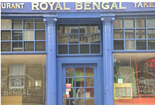
Edwardian and early 20th century shops often have a clerestory with small square panes (possibly stained or coloured)