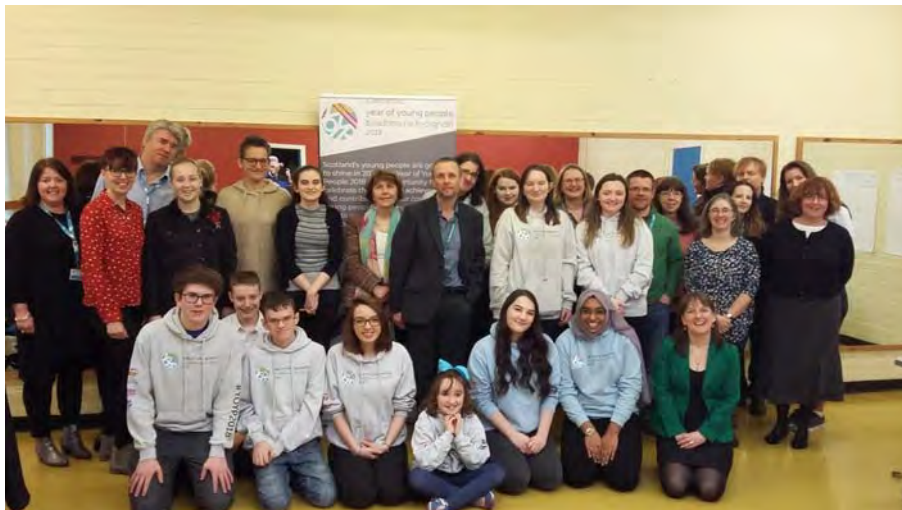
Official Launch photograph – 27/01/2018

There are also other youth organisations which are celebrating the year of young people and these include organisations such as – The Duke of Edinburgh's Award; Girlguiding; Scouting; Cadets; etc.