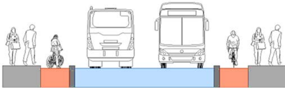
Preferred Layout - Cross Section