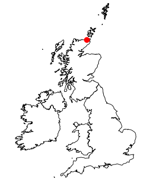
SITE LOCATION - NOT TO SCALE