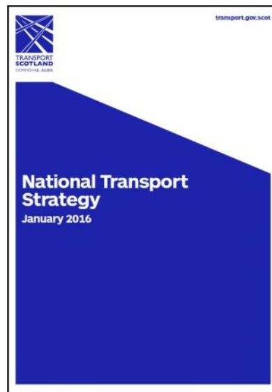
NTS Refresh 2016