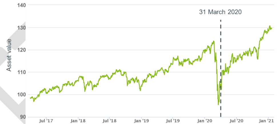
Asset value progression since 1 April 2017

The first quarter of 2020 saw significant falls in asset values as a result of the pandemic, reaching a low point in the middle of March. Whilst markets started to pick up in the second half of March, they had only partially recovered by the valuation date of 31 March 2020. The funding level reported at 31 March 2020 (see Section 3) is based on the asset value and market conditions as at this date and is therefore lower than would have been anticipated at the start of 2020. However, the funding level is only a snapshot of the Fund at one particular day. Indeed, as can be seen from the chart below, asset values have continued to improve since 31 March 2020.