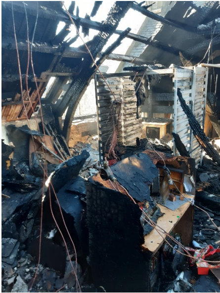
Internal: near the seat of the second fire