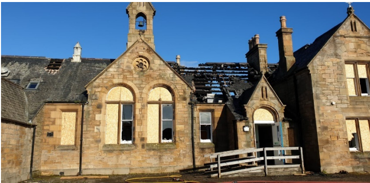
External: following the second fire

It had been planned that the nursery would return to Park site after Easter and the primary school would return to a temporary demountable school at the site in August. Unfortunately, as a result of the second fire, this is no longer possible. The effect on the pupils, staff and whole community is devastating given this second fire in the middle of the pandemic.