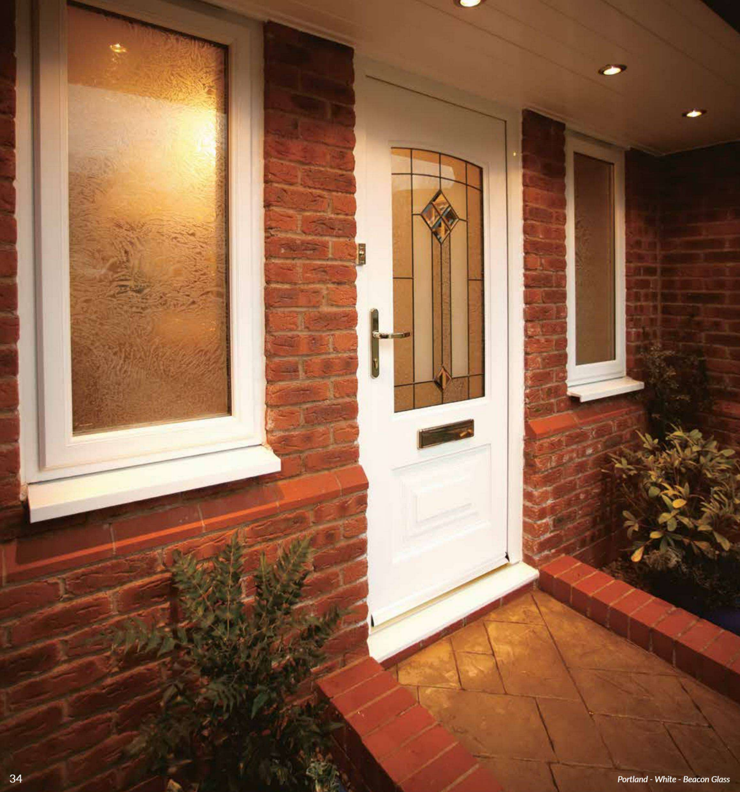
Portland - White - Beacon Glass