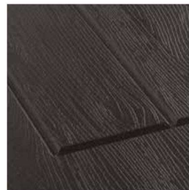
BLACK (RAL8022) Available with matching outerframe.