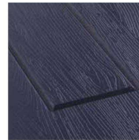
SAPPHIRE BLUE (RAL5011)