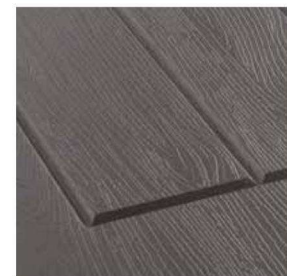
SLATE GREY (RAL7015) Available with matching outerframe.