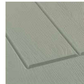
CHARTWELL GREEN Available with matching outerframe.