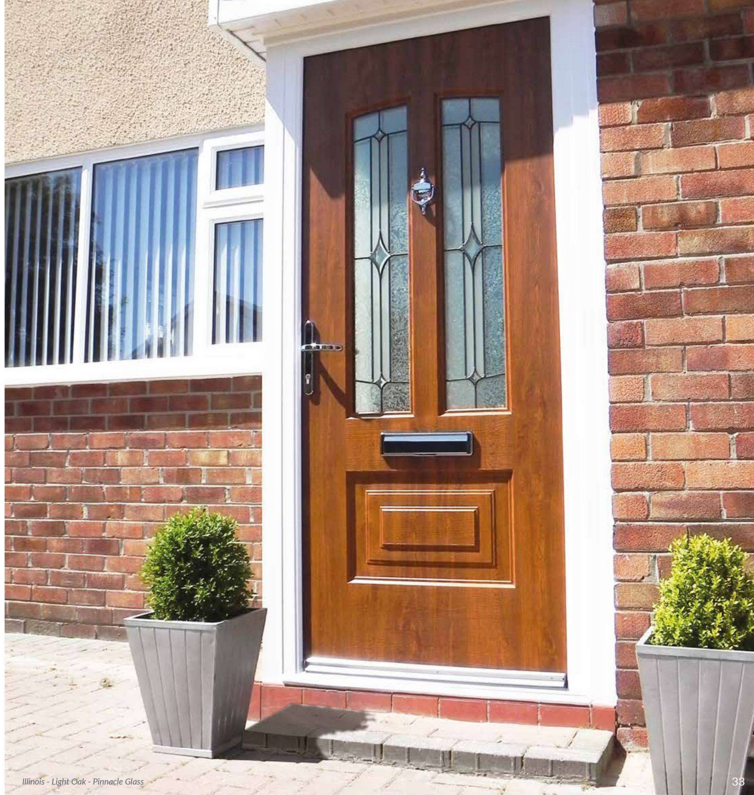
Illinois - Light Oak - Pinnacle Glass