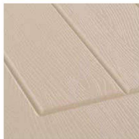
CREAM (RAL9001) Available with matching outerframe.