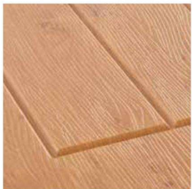
IRISH OAK Available with matching outerframe.