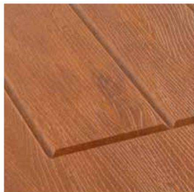
LIGHT OAK Available with matching outerframe.