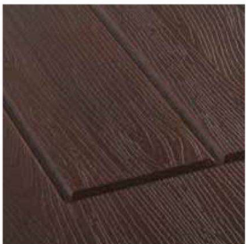
ROSEWOOD Available with matching outerframe.