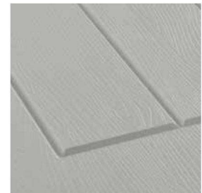
AGATE GREY (RAL7038) Available with matching outerframe.