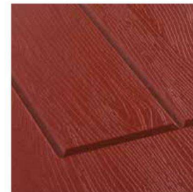
RUBY RED (RAL3011)