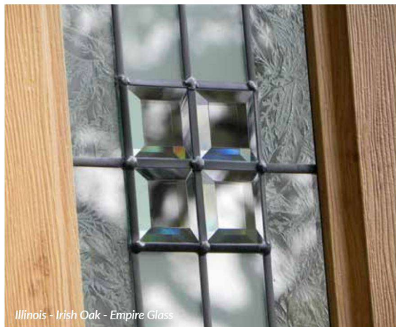
Illinois - Irish Oak - Empire Glass

Choose from 3 stunning glass designs shown here, or even sandblasted glass for a contemporary finish.