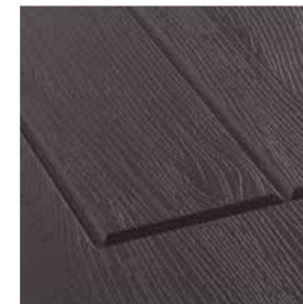
ANTHRACITE GREY (RAL7016) Available with matching outerframe.