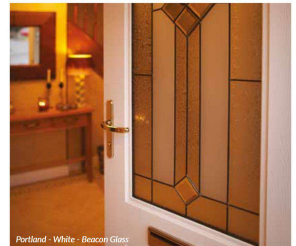
Portland - White - Beacon Glass

If your priority is letting light in, look no further than the Portland. As well as the security of S-Glaze glass, you've the option of ornate glass bevels and stunning gluechip glass to provide an astounding combination of both traditional and contemporary.