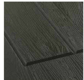
EMERALD GREEN (RAL6009)