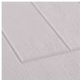
WHITE Available with matching outerframe.