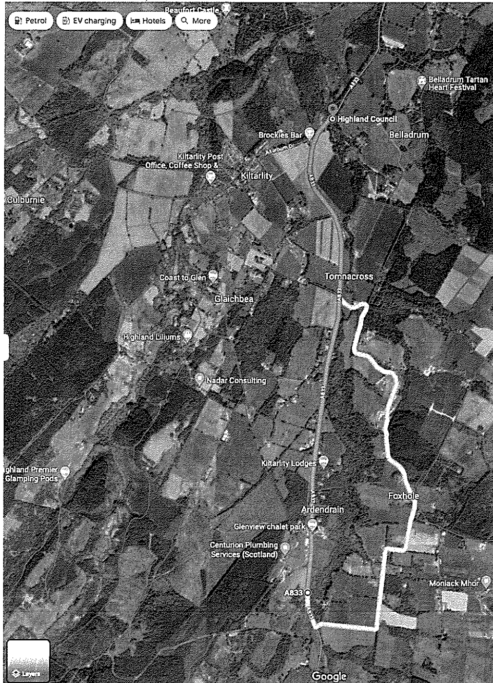
Figure 2. Section of Road for Speed Reduction